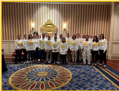
2023 EAST Community Outreach Volunteers & Program

The 2025 event will be held at the Cholla High School in Tucson, Arizona on Tuesday, January 14, 2025 from 7:00 am-3:30 pm. EAST will provide transportation to/from the JW Marriott Tucson Starr Pass Resort & Spa on the day of the event. If you are interested in volunteering, complete the online volunteer form or contact the EAST offices at managementoffice@east.org .